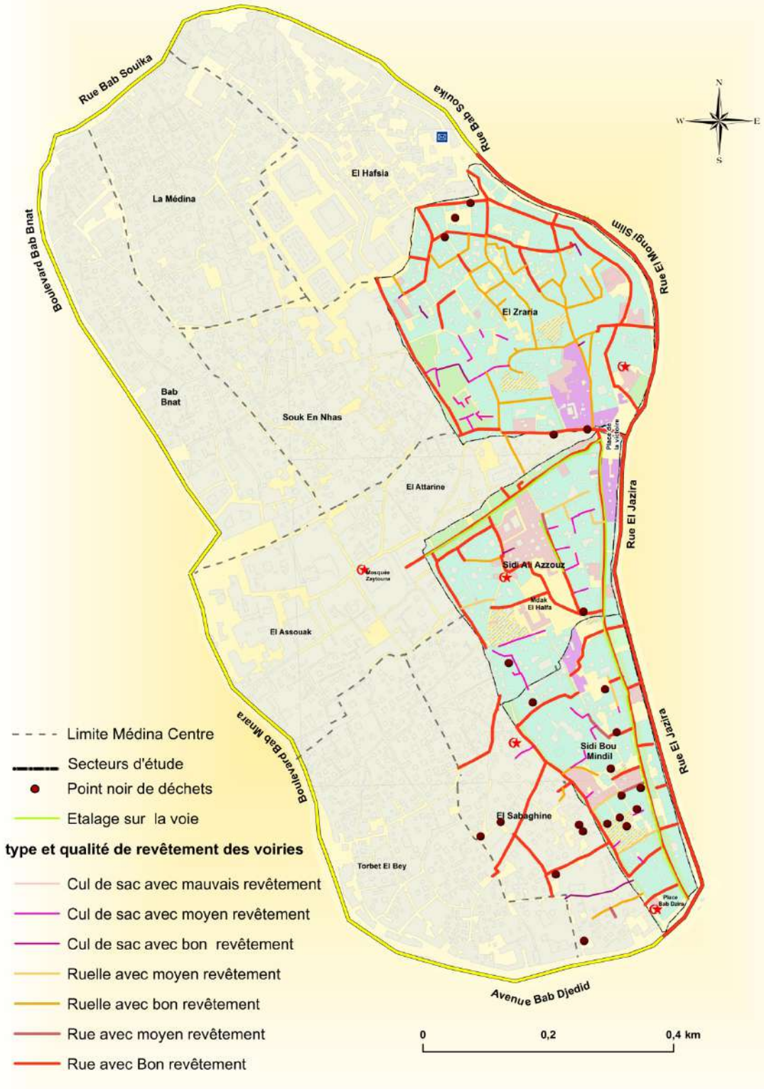
Map 2 : Features of road networks in the studied areas