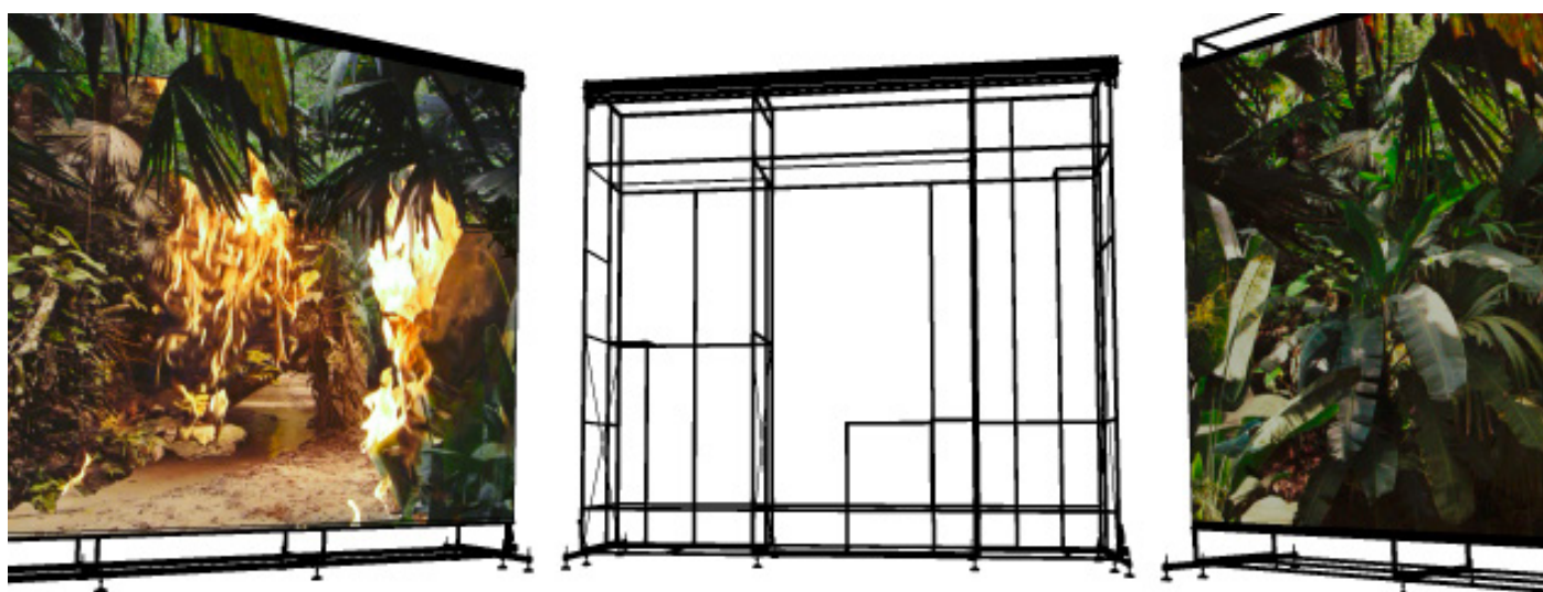
Models of the ANIMA scenography, 2022

Scenography Hélène Jourdan / Image : Noémie Goudal, Below the Deep South , 2021, Film, 11:34