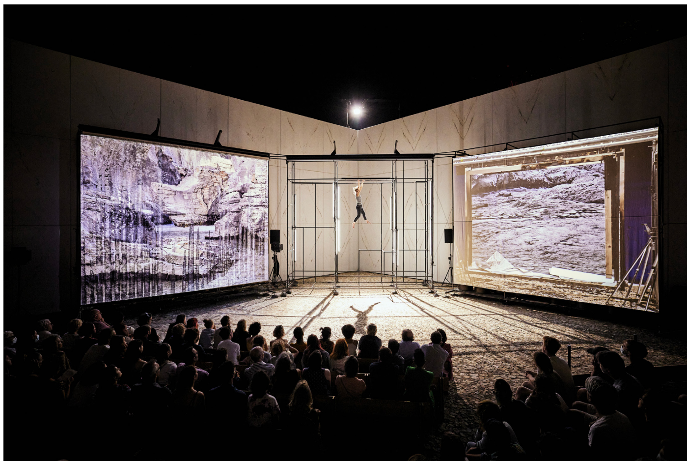
ANIMA , Collection Lambert (Avignon)