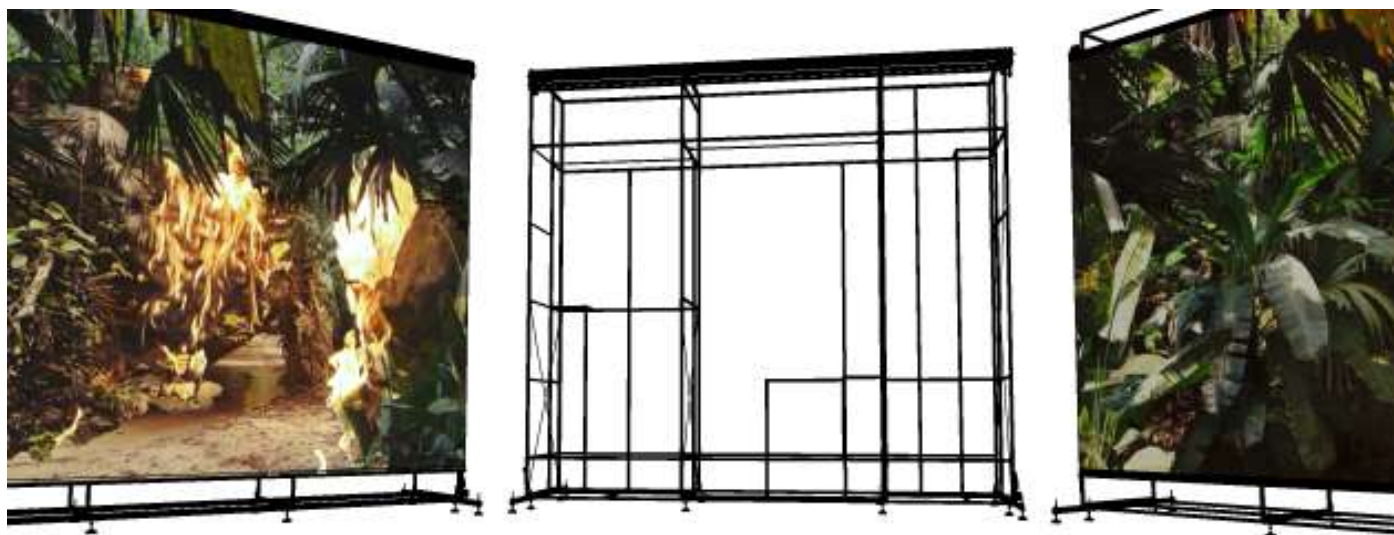
Models of the ANIMA scenography, 2022

Scenography Hélène Jourdan / Image : Noémie Goudal, Below the Deep South , 2021, Film, 11:34