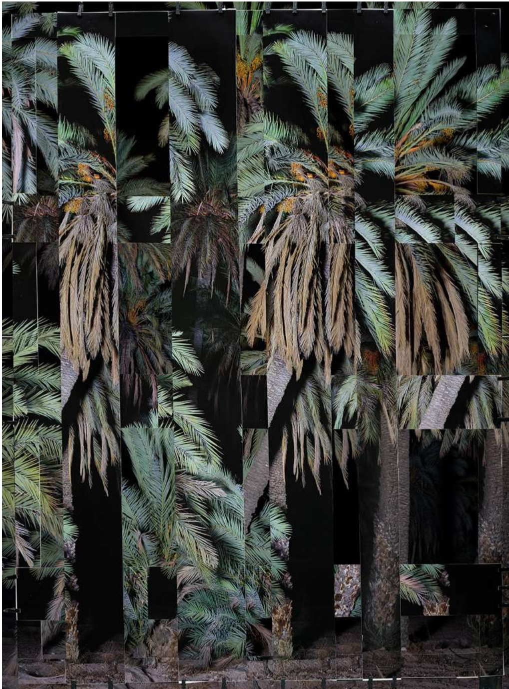
Noémie Goudal, Post Atlantica, Phoenix VI , 2021, 200 x 149,4 cm.