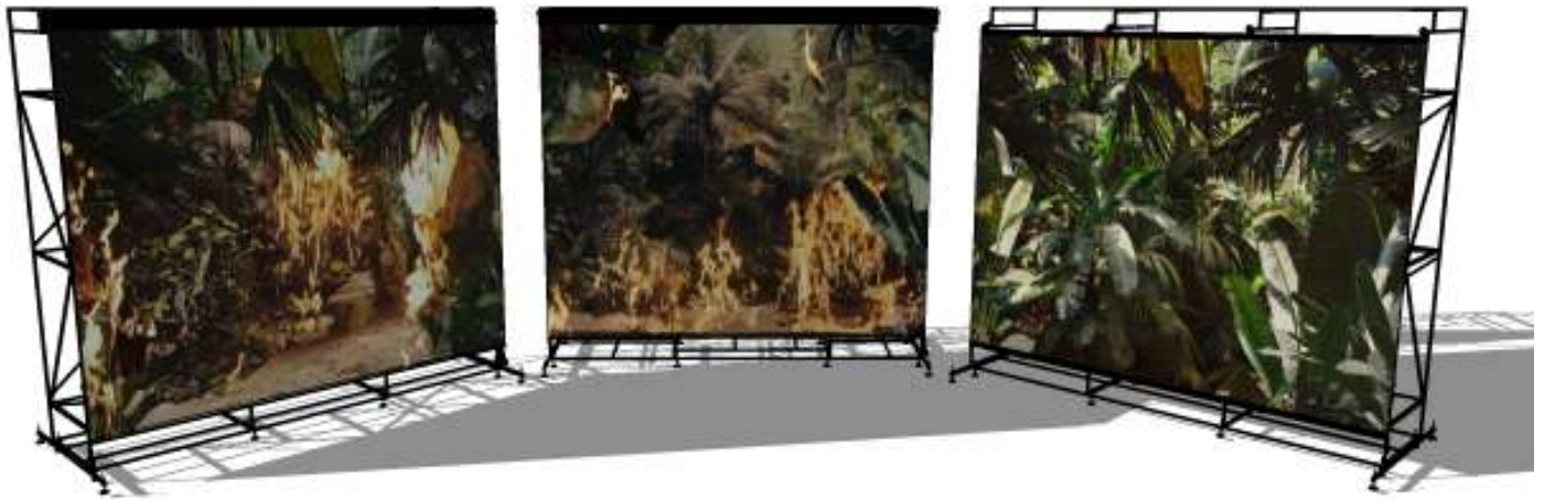
Model of the ANIMA scenography, 2022

Scenography Hélène Jourdan / Images : Noémie Goudal, Below the Deep South , 2021, Film, 11:34