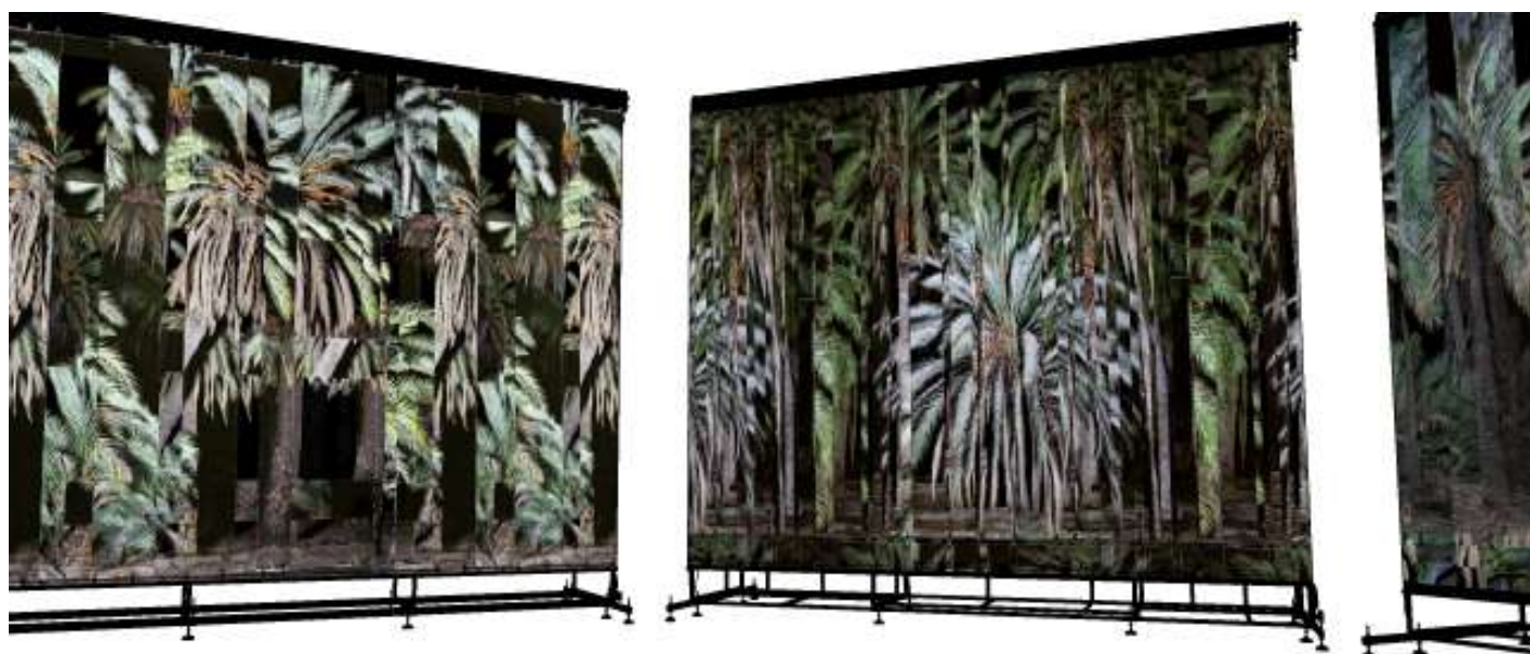
Models of the ANIMA scenography, 2022

Scenography Hélène Jourdan / Image : Film Noémie Goudal, Phoenix , 2021.