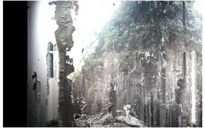
Scenographic decors, dissolution by water of a printed photograph, The Lover , Noémie Goudal, 2015