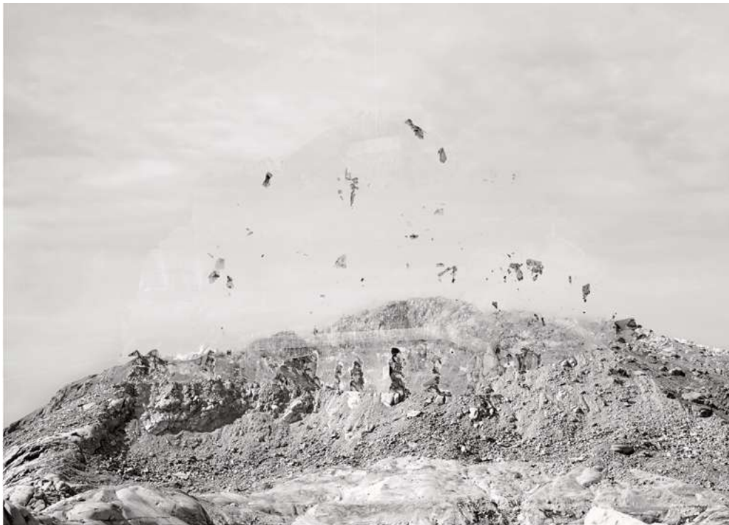
Noémie Goudal, Démantèlement I (extract), 2018