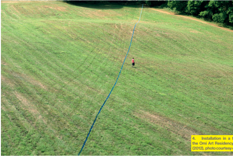
4. Installation in a field during the Omi Art Residency, New York (2012), photo courtesy of the artist

The question of how to step outside one's usual framework, and of how to find a breath of air to reinvent oneself, can be further explored in tandem with the role of cultural networks in changing one's artistic career path.