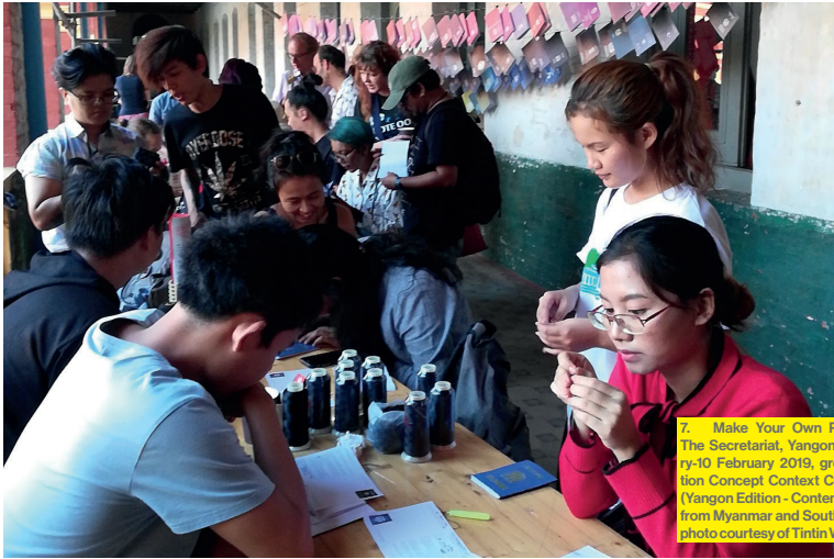
7. Make Your Own Passport at The Secretariat, Yangon, 19 January-10 February 2019, group exhibition Concept Context Contestation (Yangon Edition - Contemporary Art from Myanmar and Southeast Asia)

Barakeh. Among the examples reported were Khaled being obliged, from Berlin, to remotely organise an exhibition and workshop on archiving in Lebanon; being unable to get his visa for an exhibition in London; and again being refused a visa to participate in the Shanghai Biennale.