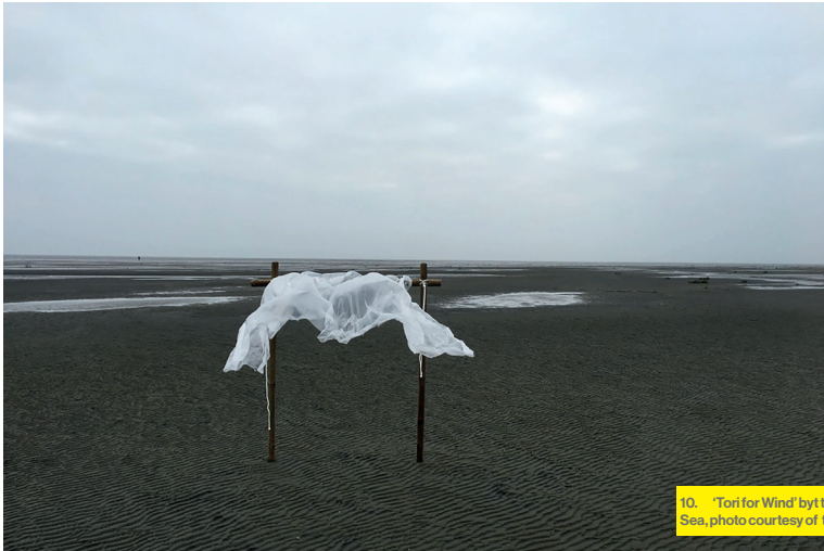
10. "Tori for Wind" by the Wadden Sea

Such processes of reflection can lead artists to relocate their practices or to adopt extreme positions – as was the case for the UK-based choreographer Avatâra Ayuso, who decided to research and collaborate with female Inuit artists in Nunavut, Canada, one of the most resilient Canadian indigenous communities. 'I have always been fascinated by life in extreme landscapes – those with challenging living conditions where humans need to adapt in order to survive – and how cultural practices emerge under those conditions. In my artistic practice, I'm also constantly trying to move away from a Eurocentric perspective. These interests have driven me to worldwide research into contemporary performing art.' 31