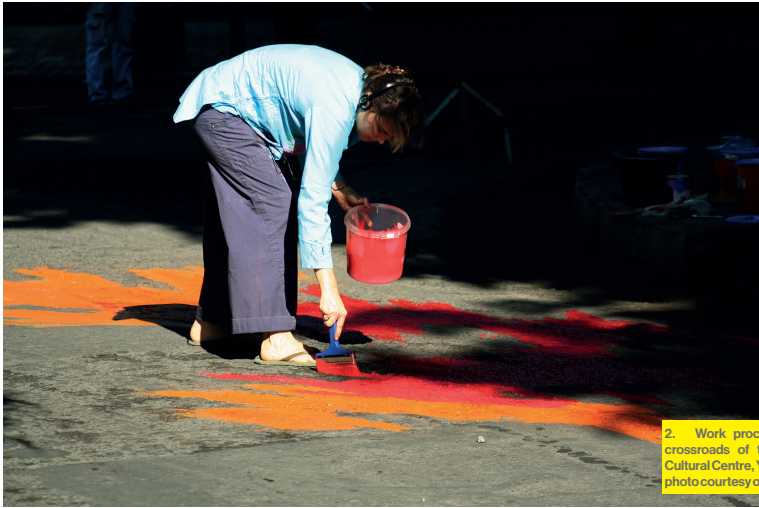
2. Work process at the crossroads of the French Cultural Centre, Yogyakarta