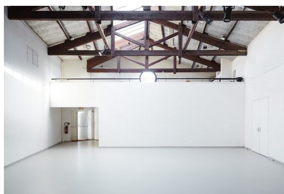
The exhibition space