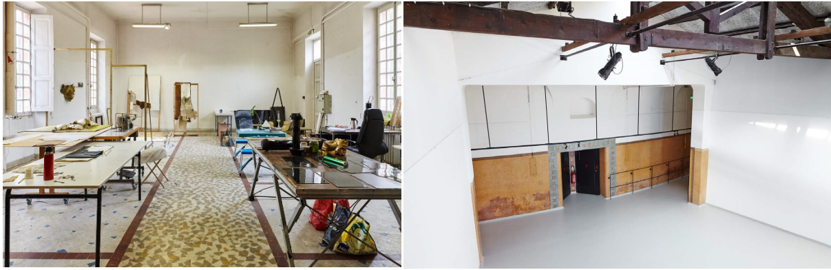
Atelier and exhibition space, 3 bis f