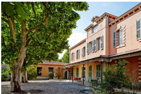
Pavillon Guiraud, building of 3 bis f

The residency will result in a solo exhibition at '3 bis f' from April 11 to end of August, 2026.