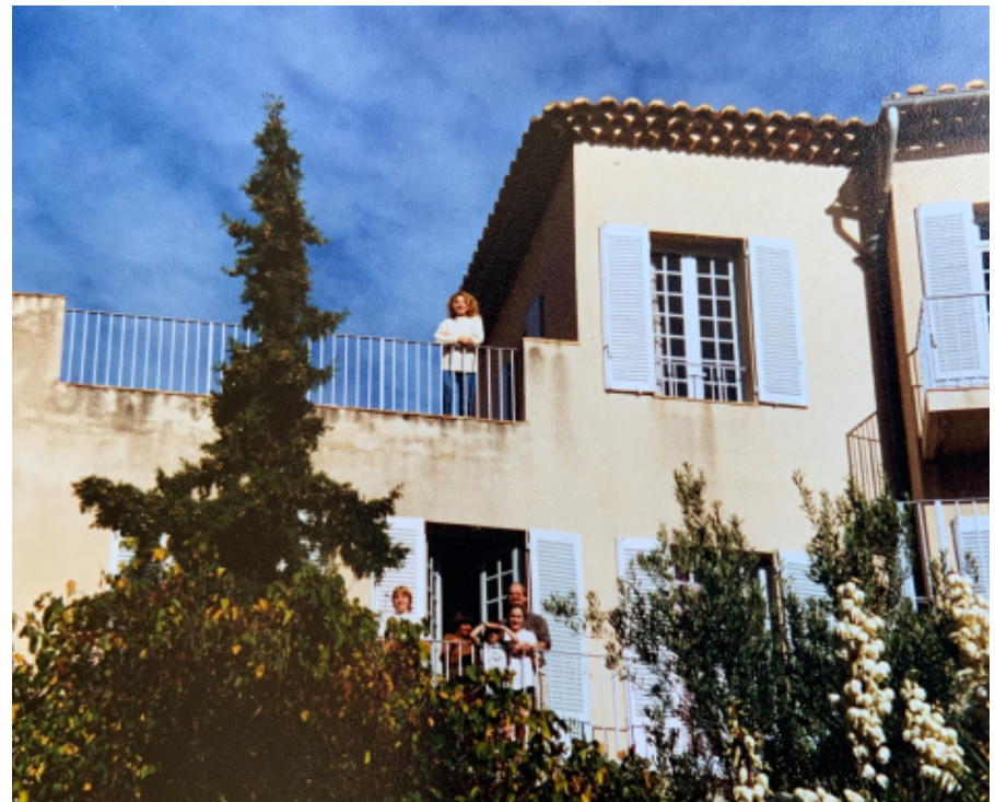
FORMER FELLOWS WITH THEIR FAMILY IN 1996

Animals other than officially registered service animals are not allowed. Fellows are responsible for securing all necessary documents and meeting all standards if bringing a service dog from outside of the country.