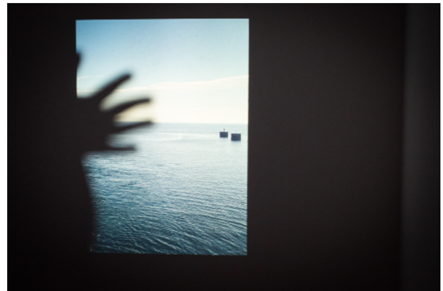
AUDIOVISUAL INSTALLATION, OPEN STUDIO SPRING 2024, VK PRESTON

Professional translators are eligible to apply. Academic translators who meet the eligibility requirements for Scholars can apply under the Scholar category. Literary translators with a theoretical or research-oriented project are encouraged to apply under the Thinker category. Translators who frame their practice as creative writing can apply under the Writer category. Applicants are welcome to choose the category they prefer according to their specific project and profile.