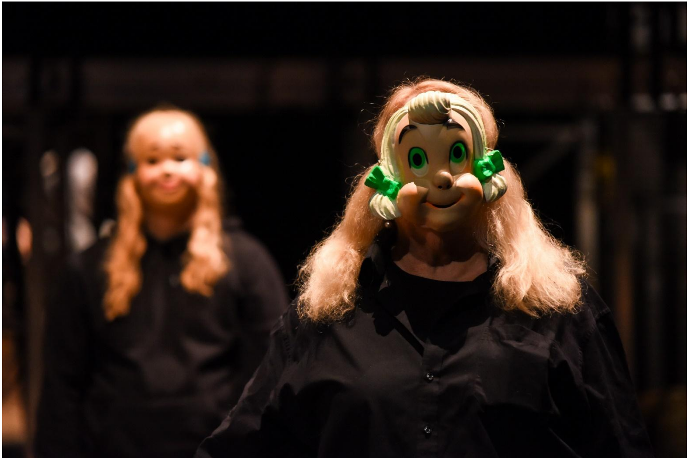
Rehearsal pictures

Let’s follow the Faulknerian sentence, from the Compsons to the Snopes, to understand how America goes from corn to popcorn, from cotton fields to Hollywood; to understand, in this ever more assertive commercialism, what America teaches us about ourselves, about our Western societies. For Absalom is also a story that passes through slave-owning Europe. Stories that have yet to be written, the stories of those who have none, because “what is revealed here is not a police truth but a colour of damnation”.