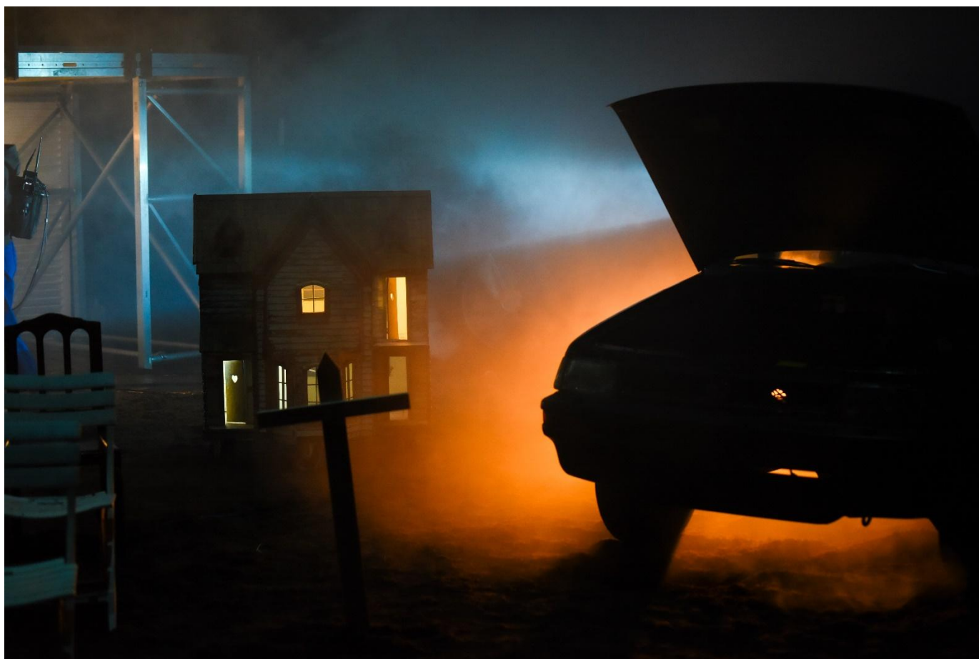
Rehearsal pictures

Available from January 2025 and season 2025-2026