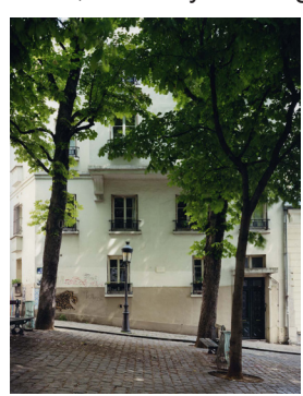
© Tomoko Yoneda Hotel - where Camus finished his first draft of 'The Stranger' 2017, courtesy of ShugoArts