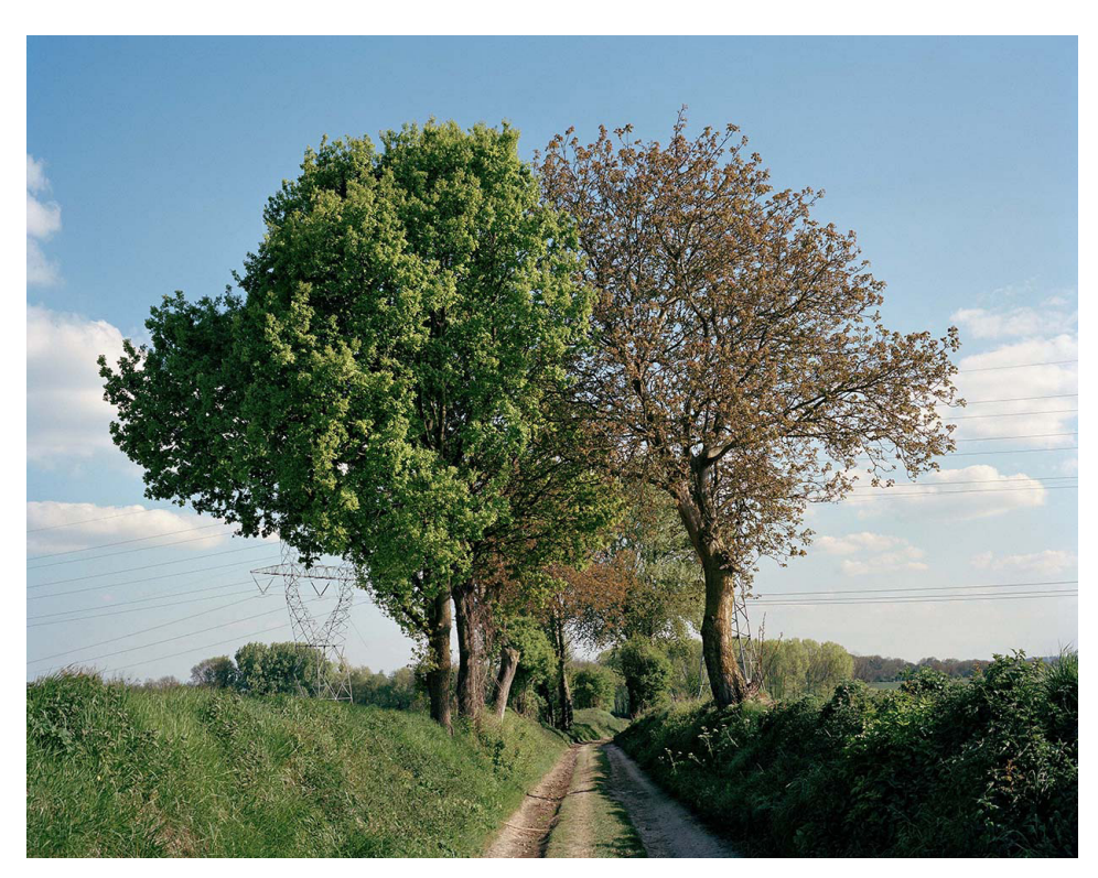
© Tomoko Yoneda, Entwined - Trees in the middle of a former trench at the Battle of the Marne, 2017, courtesy of ShugoArts