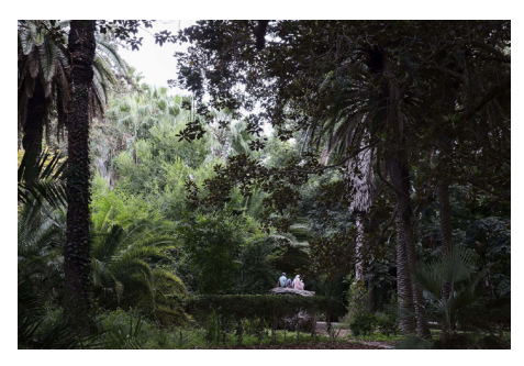
© Tomoko Yoneda Lovers, Botanical Garden of Hamma, Algiers 2017, courtesy of ShugoArts