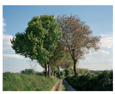
© Tomoko Yoneda Entwined - Trees in the middle of a former trench at the Battle of the Marne 2017, courtesy of ShugoArts