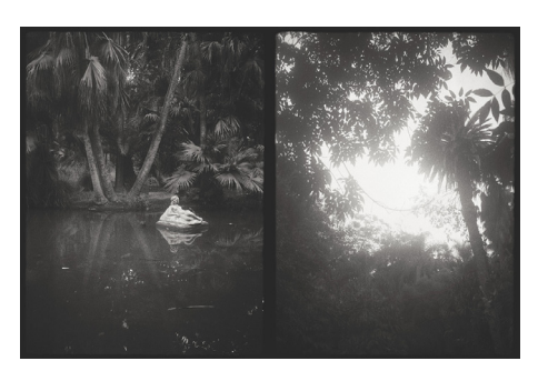
© Tomoko Yoneda A statue in a pond and sky seen through palm trees, Botanical Garden of Hamma, Algiers, 2017, courtesy of ShugoArts