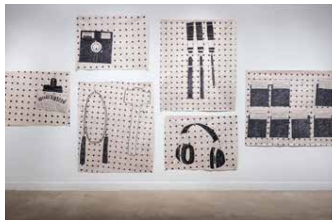
Hazel Meyer (in collaboration with Cait McKinney), Tools for the Feminist Present , 2016, courtesy the artist © photo Toni Hafkenscheid