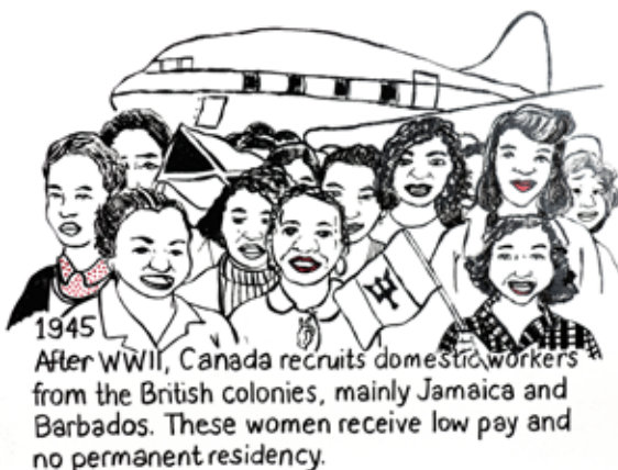
Kwentong Bayan Collective, In Love and Struggle: A Visual Timeline of Caregiving / Care Work in Canada , 2017, Blackwood Gallery – Toronto, © photo Selina Whittaker

Kwentong Bayan Collective examine the history of care work performed by Indigenous and racialized women in Canada. Their expansive illustrated timeline, In Love and Struggle: A Visual Timeline of Caregiving / Care Work in Canada (2017), was developed in collaboration with caregivers, advocates, and community allies about the real-life stories of migrant careworkers working in Canada under the federal government's Caregiver Program and encourages a critical examination of history in support of struggles for radical changes to policy. Caregivers have made invaluable contributions to Canada's social, economic, and political history, yet they have consistently had to fight for their labour to be respected and recognized, and won shifts to justice and equity rooted in caregivers' perseverance and resistance as a community.