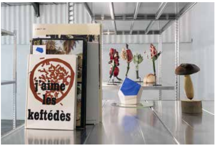
La Bibliothèque grise – ch. 2 : La Réserve, a hands-on collection curated by Jérôme Dupeyrat and Laurent Sfar, 2018, BBB art centre - Toulouse, photo © Yohann Gozard.