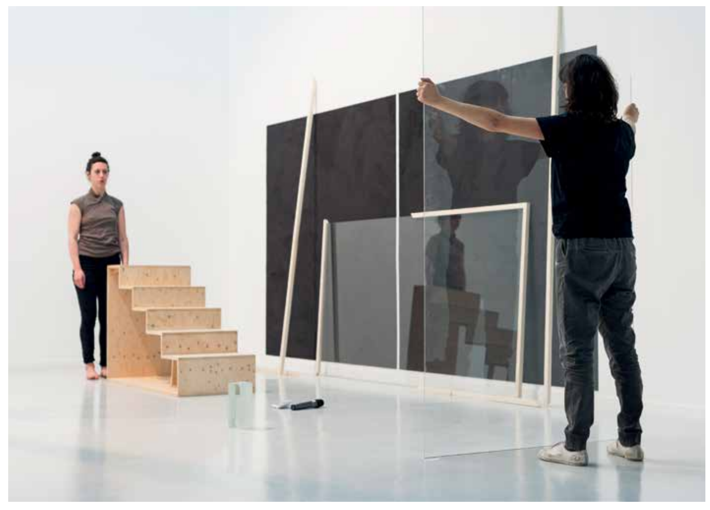
Yael Davids, A Variation on A Reading that Writes, 2014, La Ferme du Buisson

emphasis on theatre and dance), as well as social science (economics, philosophy, anthropology, etc.) The art scene is viewed as being part and parcel of the wider social, political and cultural context. Solo and group exhibitions mix with publications, talks and performances. The programme focuses on new or rarely seen talent in France, and on the significance of processes and experimentation in the performative dimension of art.